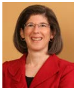
The Honorable Eleanor L. Bush