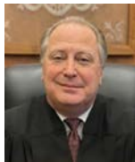
The Honorable Paul E. Cozza