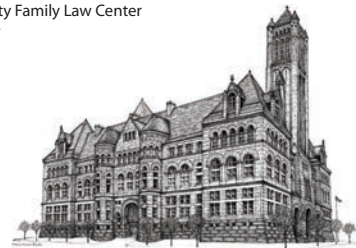
Allegheny County Courthouse 18 x 24 inch print