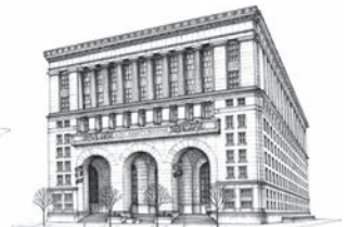
Allegheny County City-County Building 18 x 24 inch print