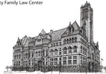
Allegheny County Courthouse 18 x 24 inch print