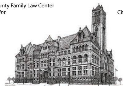
Allegheny County Courthouse 18 x 24 inch print