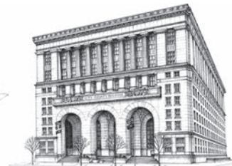
Allegheny County City-County Building 18 x 24 inch print