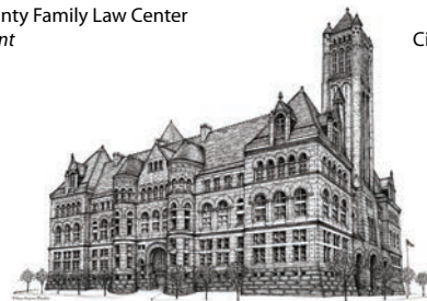
Allegheny County Courthouse 18 x 24 inch print